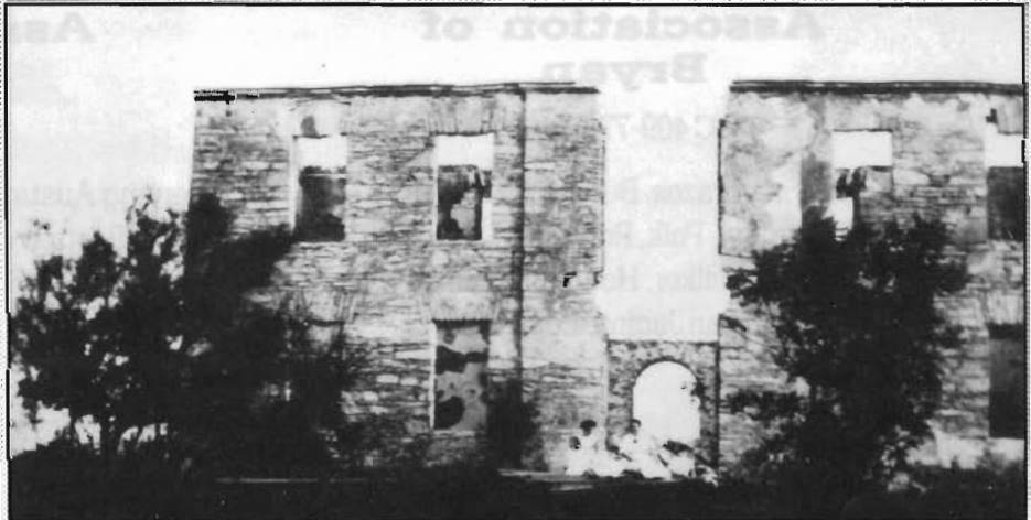
The Brookfield–Cremer–Brown home right after the devastating fire in 1911.